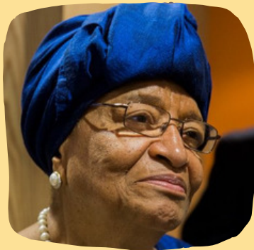
Ellen Johnson Sirleaf

The opening session sets the tone for the 5 day summit with key note speeches from The Elders, a Minister of Justice from the West African Region, a Grassroots Justice Actor and a member of The Task Force on Justice - each weighing in on the importance of regional collaboration to further the justice for all agenda.