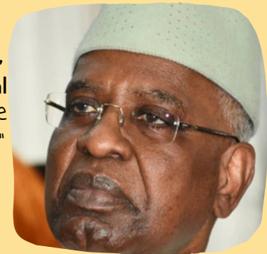
Me Malick SALL,

"Be not afraid to denounce injustice, though you may be outnumbered. Be not afraid to seek peace, even if your voice may be small. Be not afraid to demand peace."