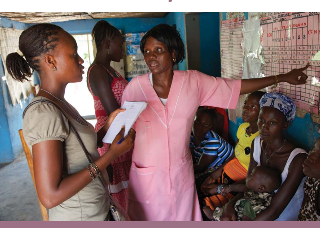
4-8 December 2017 | Budapest, Hungary