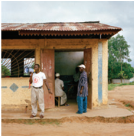
A community member calls people to attend a community rights meeting organised by paralegals at the village school in Rogbangba, Sierra Leone.