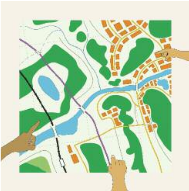
The contract should state the exact area of land that the company may use and include a clear map of that area.

This is the part of the contract that describes exactly what land the company may use for its business and explains how the company will physically mark the land. Specifically describing the land, and requiring that the company physically mark it, is important for helping to reduce potential disputes about the company's use of the land.