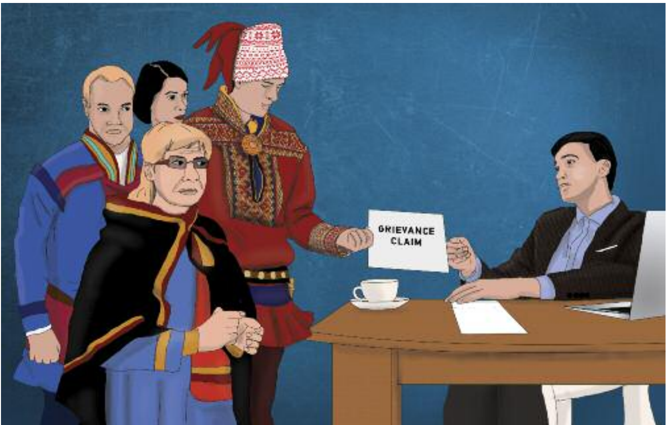
The contract should set out clear dispute resolution and grievance mechanisms that make it easy and safe for community members to report their concerns about the investment or the company.