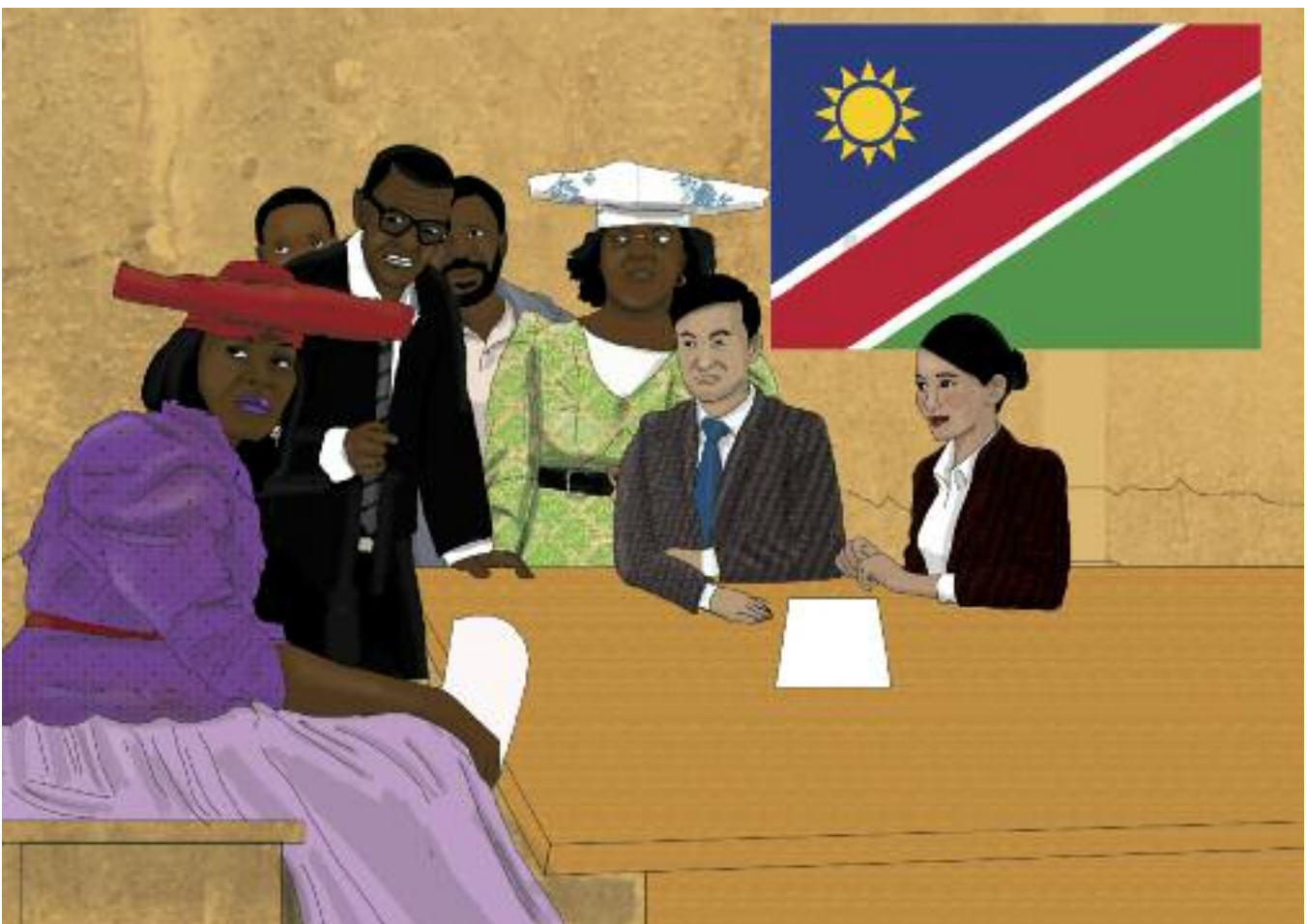
Community members should discuss the final draft contract with their own trusted lawyer before they decide to sign it.

Before signing, community members and their advocates must make sure that everything the community wants to be in the contract is in the contract. This is important, as the company may be more willing to agree to the community’s requests when it still wants to secure the community’s signature. Once community representatives have signed the contract, the company may be less motivated to agree to additional requests that the community may ask for.