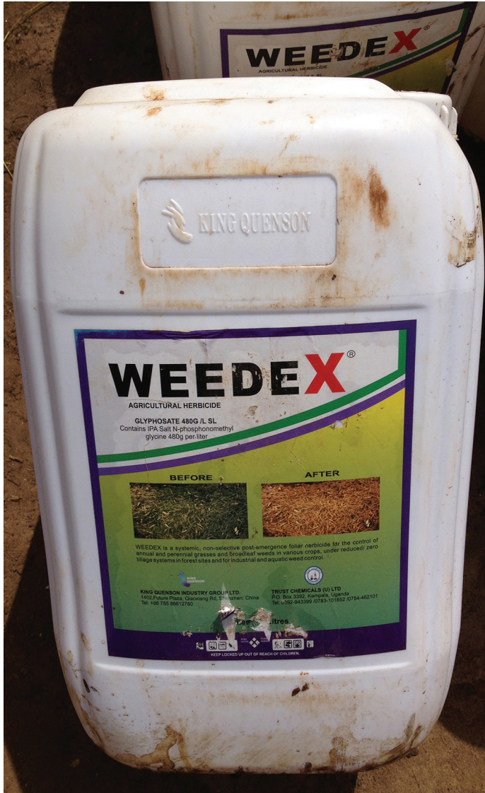
Glyphosate, a herbicide used at the seedling nursery Bukaleba.

There is a long history of violence associated with international development, including “green” development projects. Such violence has been understood in different ways, including as both direct , and structural violence. Carbon violence characterizes both the direct and structural violence that has arisen from carbon market schemes.