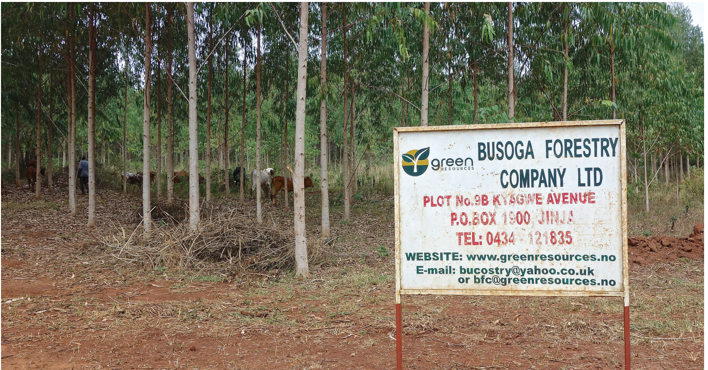
Cattle grazing illegally in plantation area.

them, once they have finished their season of planting, to go back to where they came from, as much as possible. We will try everything possible to make sure they don't come back. 45