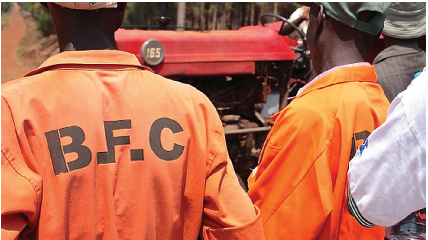
Busoga Forestry Company security uniform.

amongst local villagers about the changeable boundary of the designated community land, as well as who is eligible to access and use this land.