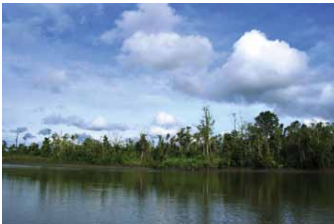
Dieback along the Ok Tedi River.

To allow operations to continue, the mine's majority shareholding was divested to a trust, the PNG Sustainable Development Program Limited (PNGSDP), registered in Singapore to ensure relative independence from day-to-day politics. 16 PNGSDP invests income from the mine in development projects across PNG, including in the CMCA communities. These projects, together with other mine-related and government sources, represent a complex web of benefits, real and potential, for the local communities. 17 The mine was also required under law to enter into legally enforceable consent agreements with affected land owners and users—the CMCAs. The first CMCAs were signed in 2001, and in accordance with a five-year review period, a revised set of CMCAs was negotiated through 2006 and 2007. The revised set of CMCAs now covers more than 90,000 people in 156 villages, stretching from villages in the highlands around the mine site near Tabubil, along the Ok Tedi and Fly River to the mouth of the Fly, and the highway from Tabubil to Kiunga. 18