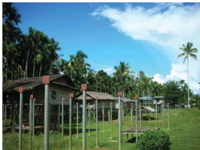
Unused House Poles, Moian Village, Middle Fly District.

The Foundation is taking some steps to improve the participation of villagers in project implementation. A “skills census” has been undertaken of each village to identify resident capacity to assist with projects. However, a focus on local labor is unlikely to result in greater community empowerment in the absence of specific actions that embed community ownership and control. The lack of community ownership was also demonstrated by another situation in Moian, where neatly erected house poles dot the village (see photo). The poles were erected as part of a housing scheme decided upon for all villages in the Middle Fly impacted region. Each village received poles (cemented into place) and zinc roofing to connect to water tanks (also delivered to the villages).