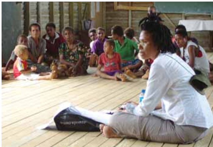
Consultations at Atkamba Village, Lower Ok Tedi.

people,” and indeed the geographical challenges are considerable. The Foundation relies primarily on village planning committee chairs as conduits to the rest of their committee and the village at large. Minutes of meetings, notices, and verbal updates are sent to the chairs for dissemination. One mine representative explained low levels of beneficiary awareness as a function of community “backwardness,” perhaps reflecting an assumption that communities with little exposure to sophisticated financial topics are not able to understand the arrangements. This conclusion—that awareness is inherently and permanently constrained by the exotic novelty of trust funds and financial flows—is not uncommon on the part of community development technocrats and resource company staff, but global experience shows that targeted and skillful discussions at the community level can indeed empower village people to understand and engage effectively quite quickly.