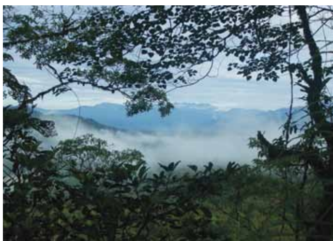
View of the Star Mountains, Western Province, PNG.